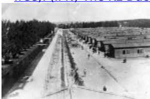
KL Dachau: general view of the prisoner barracks, high-voltage barbed-wire fence electrified at all times, KL Dachau prisoners next to the barracks. /April 1945/. (IPN) KL Dachau: general view of the prisoner barracks, high-voltage barbed-wire fence electrified at all times, KL Dachau prisoners next to the barracks. /April 1945/. (IPN)