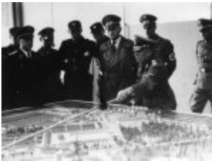
SS-Reichsführer visiting KL Dachau. SS-Reichsführer visiting KL Dachau.