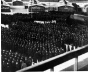
Prisoners on the roll-call square. (IPN) Prisoners on the roll-call square. (IPN)