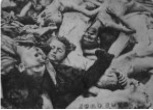
Corpses of murdered prisoners in KL Dachau. / after the liberation of the camp in April 1945 / (IPN) Corpses of murdered prisoners in KL Dachau. / after the liberation of the camp in April 1945 / (IPN)