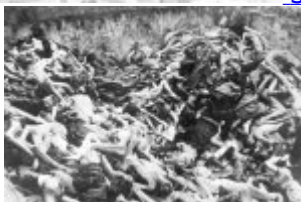
Dead prisoners in a mass grave — after the liberation. (IPN) Dead prisoners in a mass grave — after the liberation. (IPN)