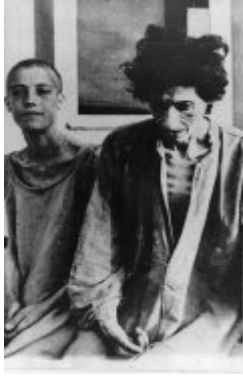
Female prisoners in the camp (IPN) Female prisoners in the camp (IPN)