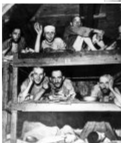
KC Buchenwald — camp "bedroom" (IPN) KC Buchenwald — camp "bedroom" (IPN)