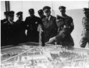
SS-Reichsführer visiting KL Dachau. SS-Reichsführer visiting KL Dachau.