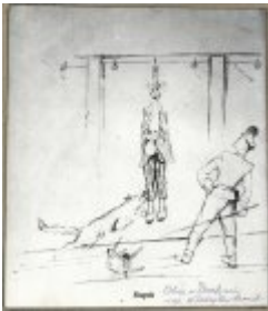
Dachau — suspension by the arms, one of the most cruel punishments used in Dachau. /KL Dachau prisoner Father Władysław Sarnik's drawing from the camp 1940–1945 (Maria Sarnik's private collection) Dachau — suspension by the arms, one of the most cruel punishments used in Dachau. /KL Dachau prisoner Father Władysław Sarnik's drawing from the camp 1940–1945 (Maria Sarnik's private collection)