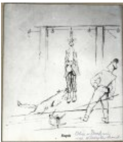
Dachau — suspension by the arms, one of the most cruel punishments used in Dachau. /KL Dachau prisoner Father Władysław Sarnik's drawing from the camp 1940–1945 (Maria Sarnik's private collection) Dachau — suspension by the arms, one of the most cruel punishments used in Dachau. /KL Dachau prisoner Father Władysław Sarnik's drawing from the camp 1940–1945 (Maria Sarnik's private collection)