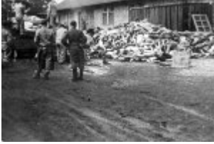
KL Dachau after liberation: Prisoners' corpses photographed by Americans after the liberation of the camp. (IPN) KL Dachau after liberation: Prisoners' corpses photographed by Americans after the liberation of the camp. (IPN)