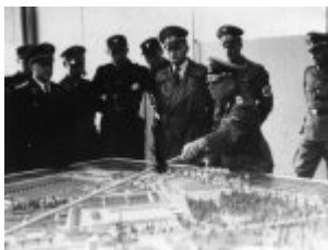
SS-Reichsführer visiting KL Dachau. SS-Reichsführer visiting KL Dachau.