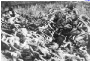
Dead prisoners in a mass grave — after the liberation. (IPN) Dead prisoners in a mass grave — after the liberation. (IPN)