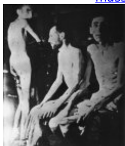
Third Reich slaves. (IPN) Third Reich slaves. (IPN)