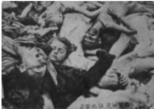
Corpses of murdered prisoners in KL Dachau. / after the liberation of the camp in April 1945 / (IPN) Corpses of murdered prisoners in KL Dachau. / after the liberation of the camp in April 1945 / (IPN)