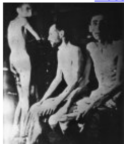
Third Reich slaves. (IPN) Third Reich slaves. (IPN)